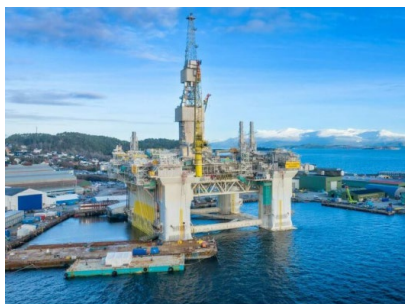
Njord A; Source: Aker Solutions

Safelift can also point to the delivery of multiple products largely from their standard product range for inclusion within the refurbishment scopes on the Njord A floating platform & Njord B floating storage vessel during their recently completed life extension upgrades, which followed a site visit to their premises by representatives from both the Operator & Contractor to discuss best practice & assess their suitability for the applications they've been adopted for ▼