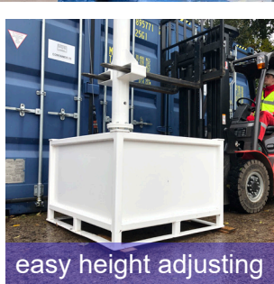
easy height adjusting